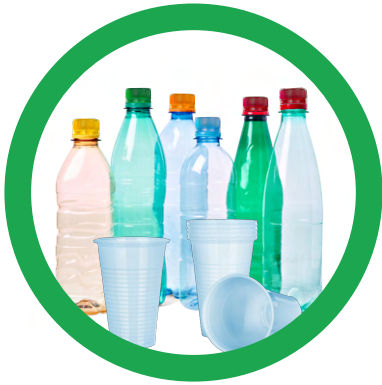
CLEAN BEVERAGE BOTTLES & CUPS