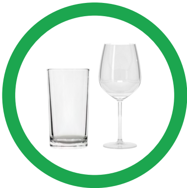
DRINKING & WINE GLASSES