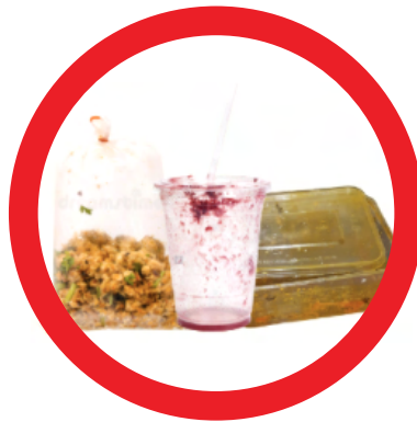
PLASTIC PACKAGING CONTAMINATED WITH FOOD