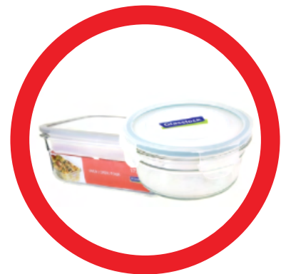
OVEN-SAFE FOOD CONTAINERS