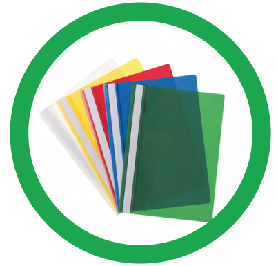
FILES & FOLDERS