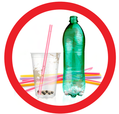
DIRTY BOTTLES, CUPS & STRAWS