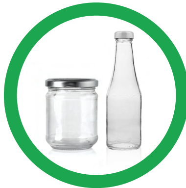
FOOD JARS/ CONTAINERS