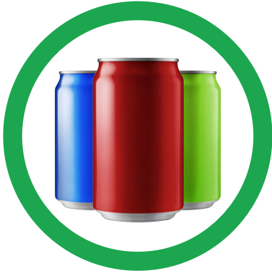
CLEAN BEVERAGE CANS