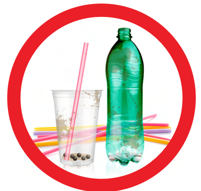
DIRTY BOTTLES, CUPS & STRAWS