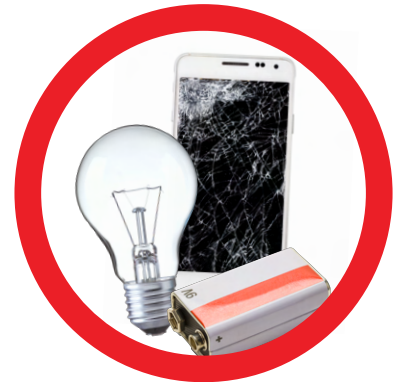
E-WASTE ICT Equipment, Batteries, Bulbs & Lamps