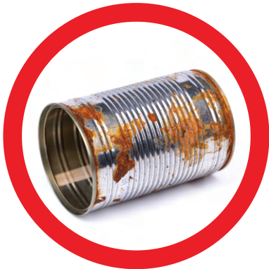
RUSTY METAL CANS

Please deposit into designated e-waste recycling bins