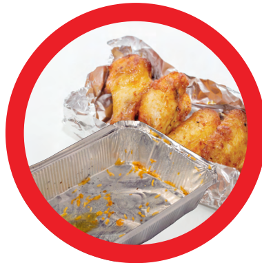
DIRTY ALUMINIUM FOIL & TRAY