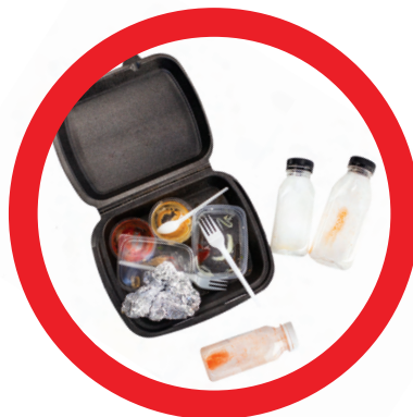
PLASTIC PACKAGING CONTAMINATED WITH FOOD