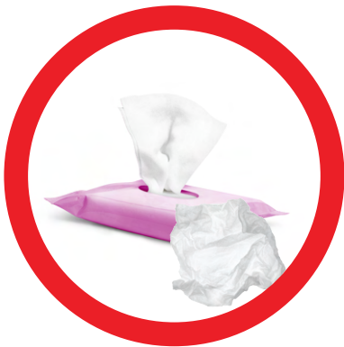
TISSUE PAPER & WET WIPES