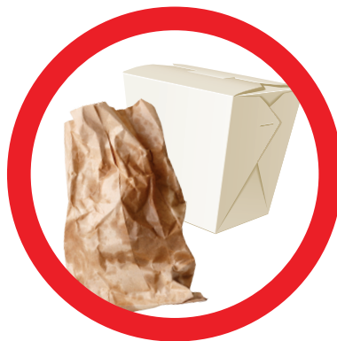
STAINED FOOD WRAPPERS & CONTAINERS